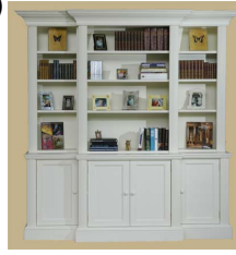
bookcase or shelves