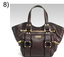
the bag, purse